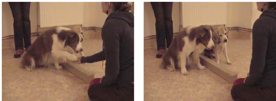
Fig. 1. Photos of the experimental setup. The experimenter avoided eye contact with the dogs. The owner was standing behind the dogs.

In addition to the number of trials during which the subject continued to obey the command, we analyzed the hesitation or willingness of the subject to do so. In our experiment, the experimenter would repeat the command up to 10 times. If the